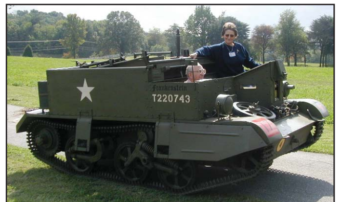
...and away they go heading towards a hayfield!