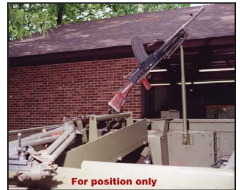
Anti aircraft mount and Enfield grenade launcher in mount.

propels the 4-ton vehicle up to about 35 mph. It has garnered several awards including five awards at the 2000 Aberdeen East Coast Show including Best in Show and and last summer won Best-in-Class for restored foreign vehicles at the MVPA National Convention at Fort Lee, Virginia.